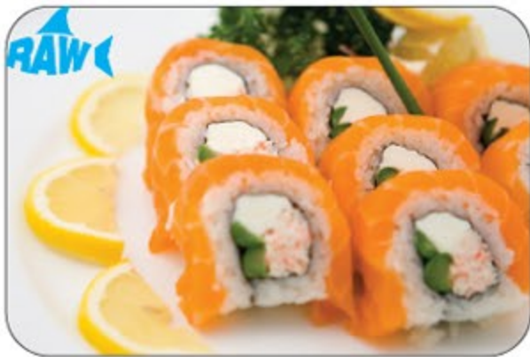
Philadelphia Roll Salmon, crab and avocado rolled with rich & creamy philadelphia cream cheese