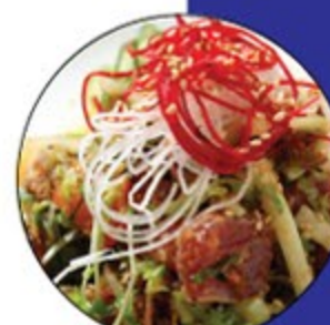
Smoked Salmon Salad