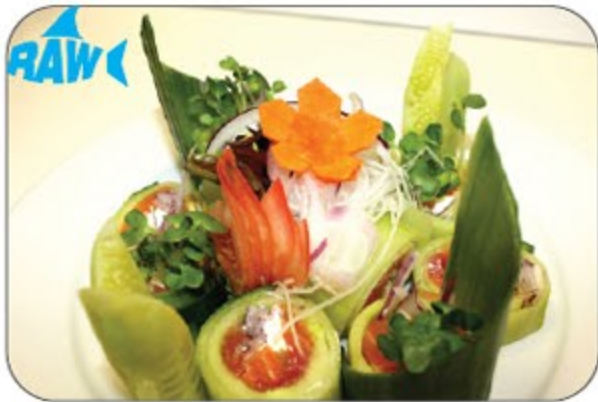
Rock N' Roll Salmon, tuna, kaiware, and cheese in the fresh cucumber wrap