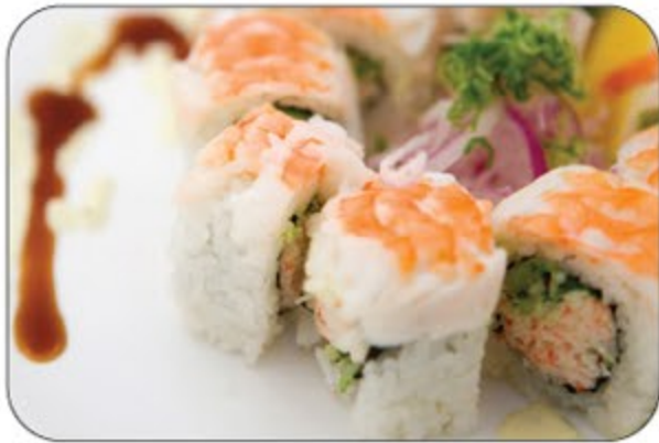
Tiger Roll California Roll, Tiger patterned back shrimp and eel sauce (california roll, shrimp on top)