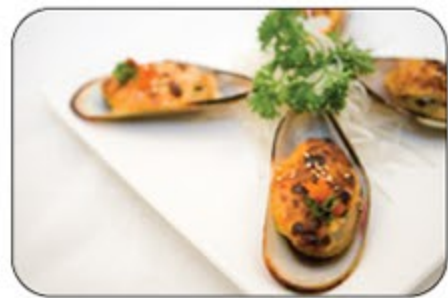
B.G.M. Baked Green Mussel w/ special sauce