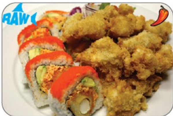
Popcorn Scallop Pop-up the scallops with sweet (deep fried bay scallop, spicy crab avo w/ masago and eel sauce)