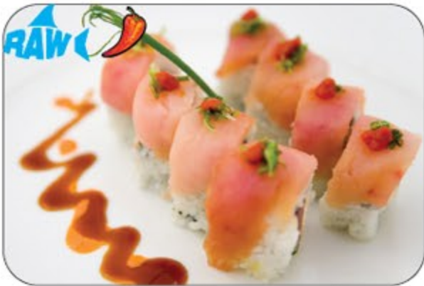
Albacore Delight Crab, avocado and garlic sauce topped with albacore for albacore lovers