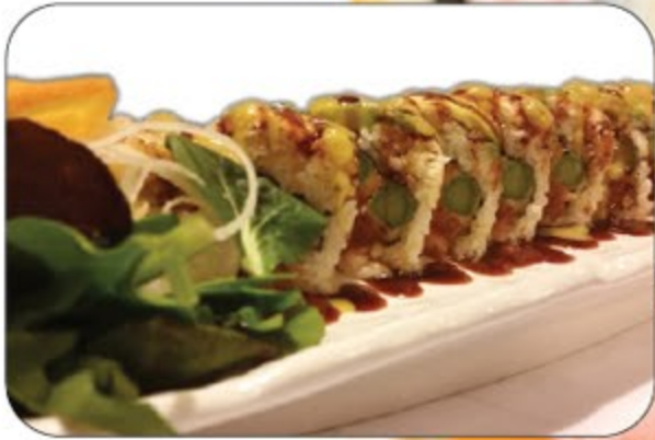
MSG Spicy tuna & Tempura asparagus with Tempura white fish and Avocado on top