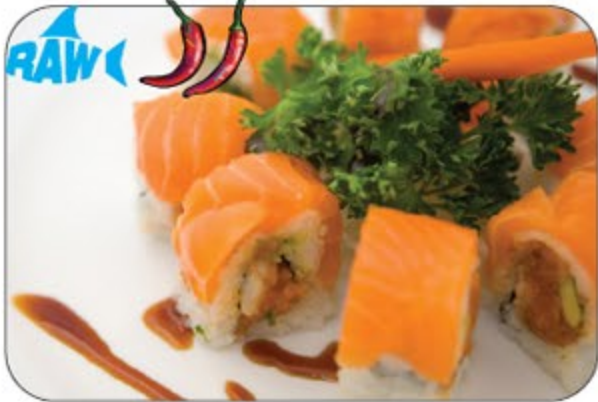
Alaskan Roll Enjoy the rich taste of fresh salmon on top (spicy tuna, avocado, shrimp)