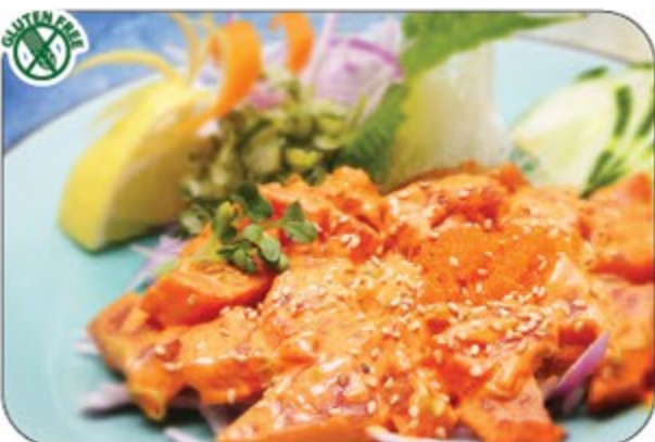
Spicy Tuna Sashimi