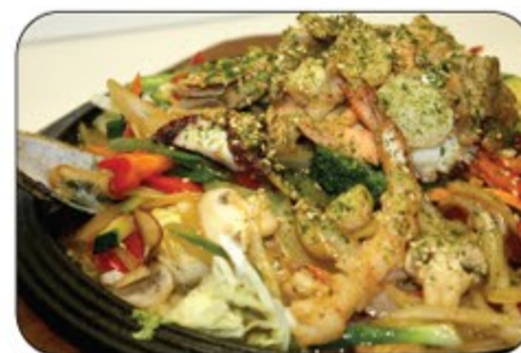
Crazy Seven w/ Miso soup & Rice (Grilled seven best choice of seafood & vegetable)