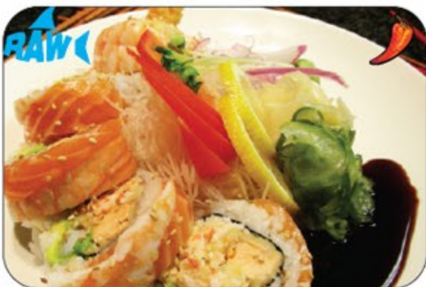
Crazy Love Roll Fresh and cooked fish combination makes you crazy love! (sp. crab, shrimp & salmon tempura with avo, shrimp salmon on top)