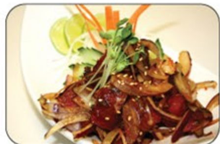
Ahi Poke Traditional Hawaiian way to serve fresh chunk tuna