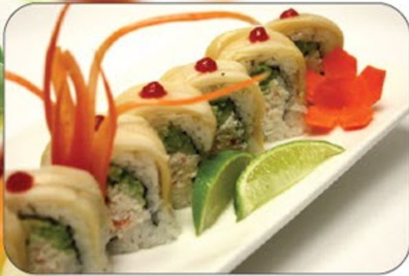
Mt. Hood Imitation crab, Avocado, Cucumber, Asparagus Ono(white tuna) on top