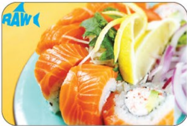
Washington Roll Fresh salmon wrapped around california roll. Two tasty treats rolled into one!