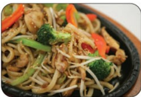
Yaki Udon (Stir-fried noodle w/ vegetable)