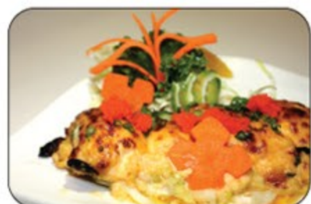
Green Salmon Chopped green mussel, avocado, wrapped w/ salmon and baked