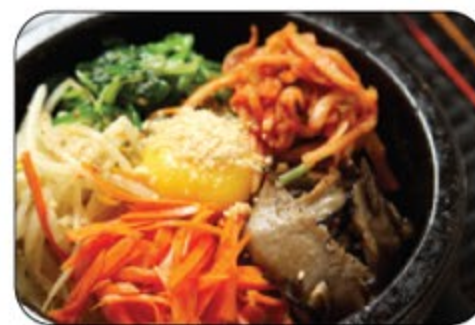
Bibimbab w/ Miso soup (Sizzling Korean-Style mixed bowl)