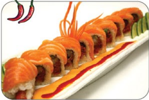
503 Roll Avocado, Spicy tuna, Shrimp tempura Fresh salmon on top