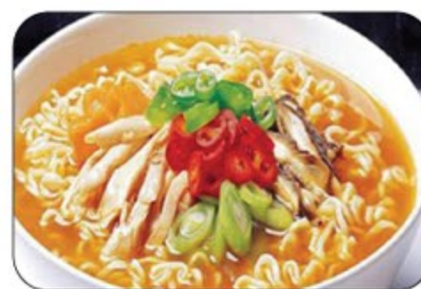
Spicy Ramen (Korean style)