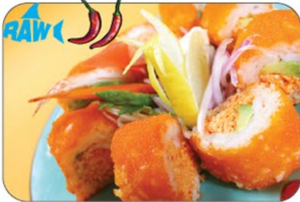
Mexican Roll Feel the picante in the Japanese way! (spicy crab, avo, cucumber, shrimp rolled in smelt roe)