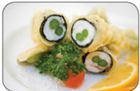
A & A Tempura Asparagus wrapped with albacore, then crispy tempura w/ ponzu sauce