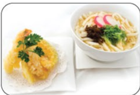
Udon (Japanese noodle soup) Tempura & Udon