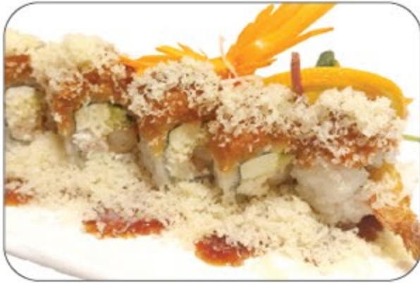
White Roll Avocado, Cream cheese, Crab & Shrimp tempura inside, Spicy tuna and crunch flakes on top