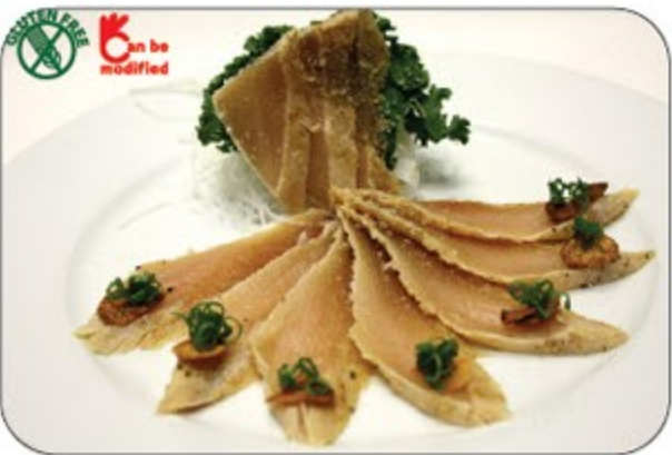
Garlic Albacore Sashimi