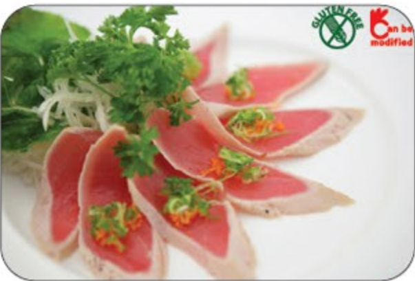
Seared Tuna Sashimi