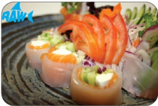
Little Saigon Relish the freshness of vietnam wrapped in rice paper. (salmon, cucumber, cheese, red onion, kaiware)