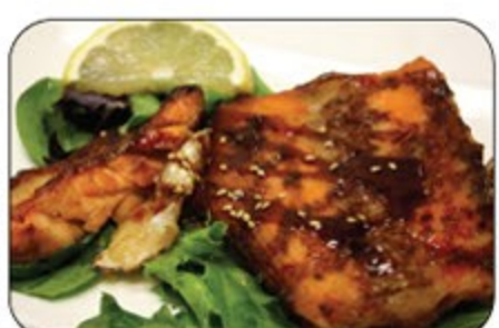
Salmon Miso Yaki Baked salmon w/ House special sauce