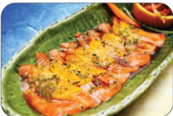
Sunkist Salmon Sashimi