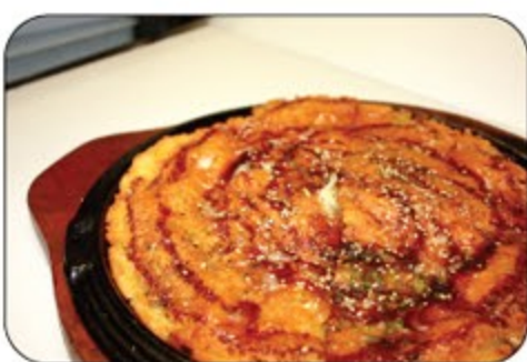
Jigimi (Seafood Korean-Style Pizza)