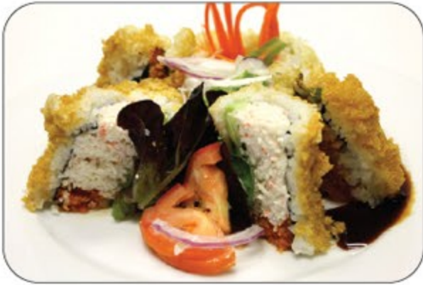
California Dream Crunch corn flake wrapped and golden-fried (tempura california roll & spicy tuna roll w/ corn flakes)