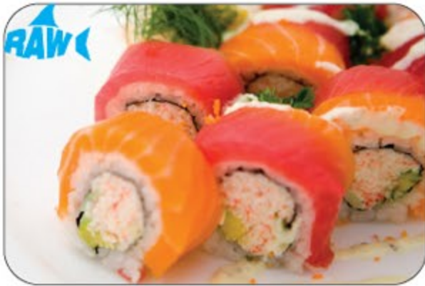
Ninja vs Samurai Salmon vs Tuna! You decide who win! (california roll with salmon & tuna on top)