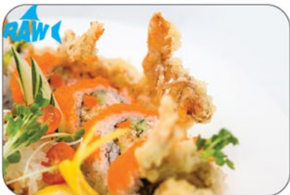
Spider Roll Crunch crispy soft shell crab with avocado, crab & smelt roe