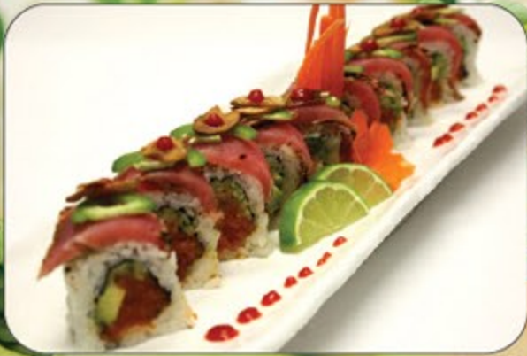
Tuna on Fire Rich taste of pepper tuna and jalapeno (Avocado, in Jalapeno, Spicy tuna)