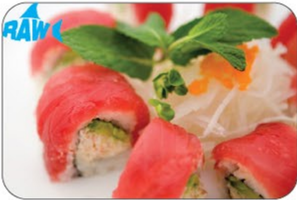
Hawaiian Roll Tuna with both real-crab & imitation crab and delicious goma sauce