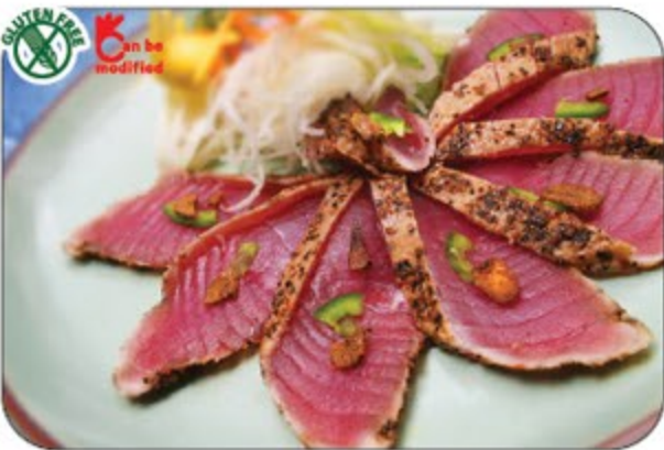
Pepper Tuna Sashimi