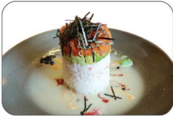
Crazy Tower Sushi rice, Crab, Avocado, Spicy tuna sashimi