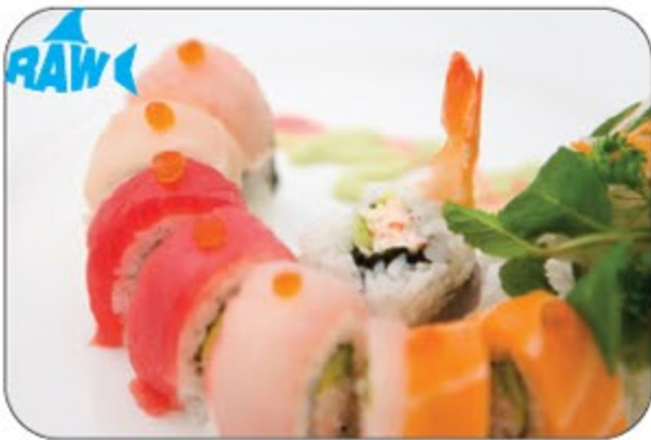
Rainbow Roll Enjoy 5 different taste and color! (tuna, white fish, salmon, yellowtail, shrimp & smelt egg)