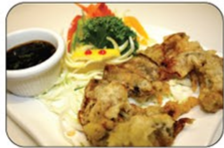
Soft Shell Crab Deep fried soft shell crab w/ ponzu sauce