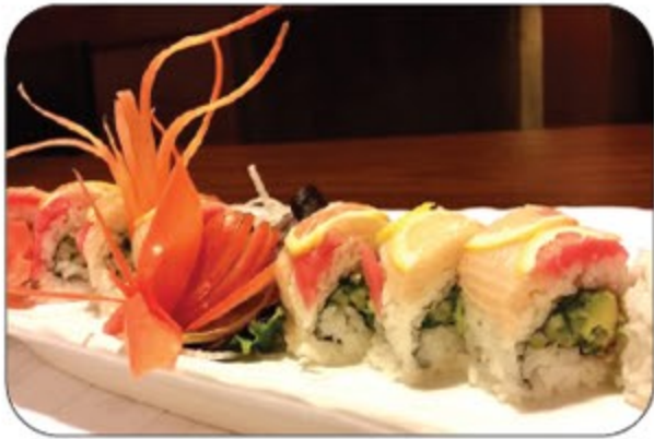
OML Asparagus, Cucumber, Avocado & Green Onion with Tuna, Yellowtail and Lemon on top