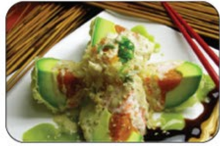
Monkey Brain Half-cut avocado inside spicy tuna and crab deep fried w/ delicious secret sauce