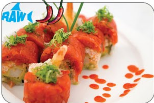
Red Blossom Hot & spicy red blossom fully satisfied you (shrimp tempura, spicy crab, and spicy tuna on top)