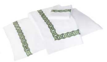
Pillowcases S $250 K $275 *Sold by the Pair