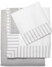
Flat Sheet Q $425 K $450

AVAILABLE IN NATURAL WHITE | ITALIAN WOVEN EGYPTIAN COTTON SATEEN