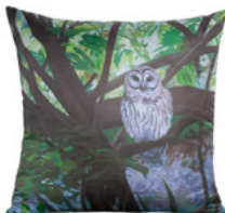
Silk Owl Pillow $500