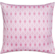
All-Over Euro $225