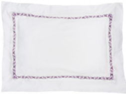
Bordered Sham S $225 K $250