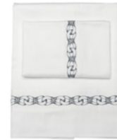
Flat Sheet Q $425 K $450

AVAILABLE IN NATURAL WHITE | ITALIAN WOVEN EGYPTIAN COTTON SATEEN