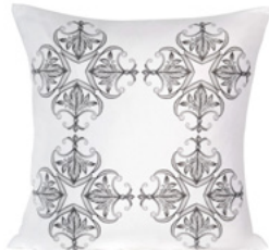
Engineered Euro $225