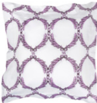
All-Over Euro $225