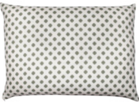
Linen XL Euro $295