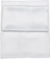
Fitted Sheet Q $395 K $495