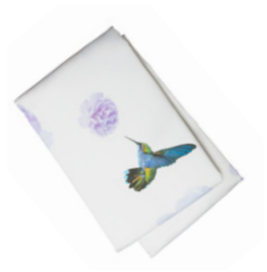
Duvet Q $595 K $695

AVAILABLE IN WHITE | ITALIAN WOVEN EGYPTIAN COTTON SATEEN