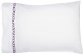
Pillowcases S $250 K $275 *Sold by the Pair