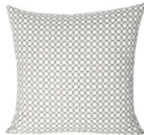
Linen Accent Pillow $215