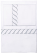
Flat Sheet Q $425 K $450

AVAILABLE IN WHITE | ITALIAN WOVEN EGYPTIAN COTTON SATEEN