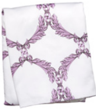
All-Over Duvet Q $595 K $695