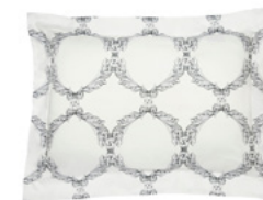
All-Over Sham S $195 K $225