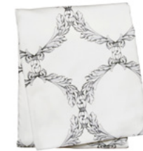
All-Over Duvet Q $595 K $695