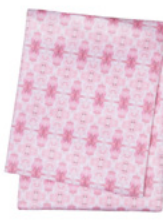
All-Over Duvet Q $595 K $695