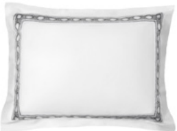
Bordered Sham S $225 K $250