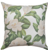
Linen Accent Pillow