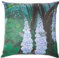
Silk Foxglove Pillow $500