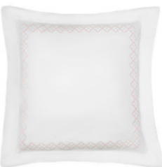
Bordered Euro $250