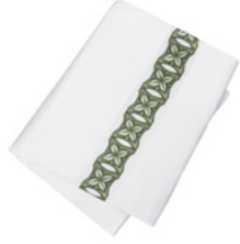
Simple Bordered Duvet Q $625 K $750