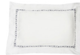
Bordered Sham S $225 K $250