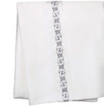
Bordered Duvet Q $625 K $750