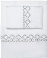
Flat Sheet Q $425 K $450

AVAILABLE IN WHITE | ITALIAN WOVEN EGYPTIAN COTTON SATEEN