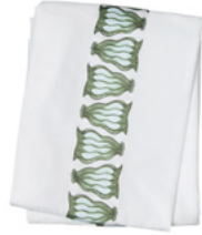
Bordered Duvet Q $625 K $750