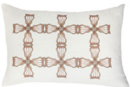
Linen Medallion Pillow