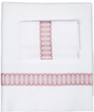
Pillowcases S $250 K $275 *Sold by the Pair