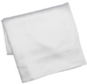
Duvet Q $725 K $850