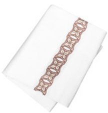
Small Bordered Duvet