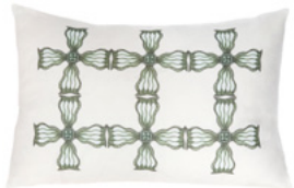
Linen Medallion Pillow $235