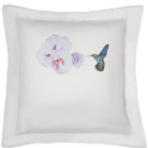
Euro Right $225