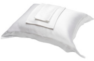
Pillowcases S $240 K $295 *Sold by the Pair