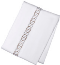
Bordered Duvet Q $625 K $750