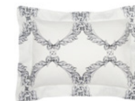
All-Over Boudoir $175