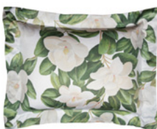
Linen All-Over Euro