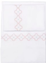
Flat Sheet Q $425 K $450

AVAILABLE IN WHITE | ITALIAN WOVEN EGYPTIAN COTTON SATEEN