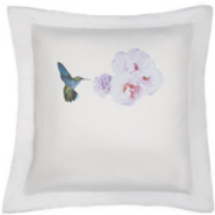
Euro Left $225