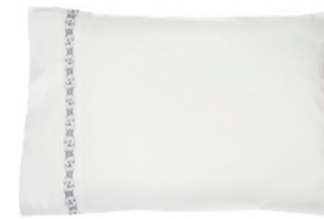
Pillowcases S $250 K $275 *Sold by the Pair