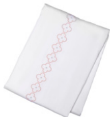
Bordered Duvet Q $625 K $750