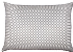
Linen XL Euro $295