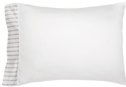
Pillowcases S $250 K $275 *Sold by the Pair