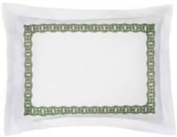
Bordered Sham S $225 K $250