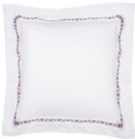
Bordered Euro $250