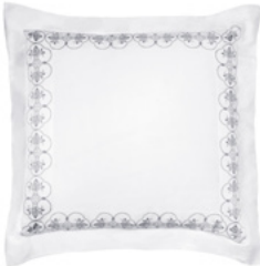
Bordered Euro $250