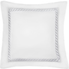
Bordered Euro $250