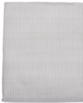
Narrow Stripe Duvet Q $595 K $695