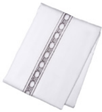
Bordered Duvet Q $625 K $750