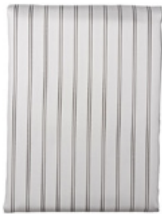
Wide Stripe Duvet Q $595 K $695