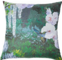
Silk Hummingbird Pillow $500