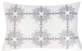
Linen Medallion Pillow $235