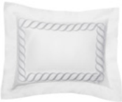
Bordered Boudoir $200