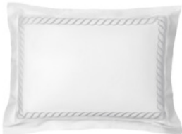
Bordered Sham S $225 K $250