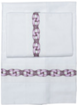
Flat Sheet Q $425 K $450

AVAILABLE IN WHITE | ITALIAN WOVEN EGYPTIAN COTTON SATEEN