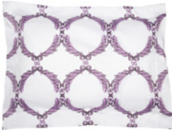
All-Over Sham S $195 K $225