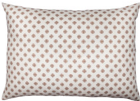
Linen XL Euro