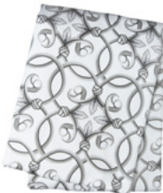
All-Over Duvet Q $595 K $695