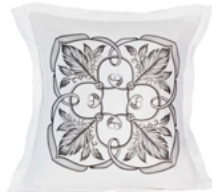
Accent Pillow $125