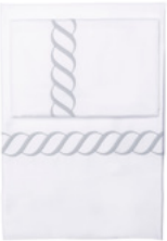
Pillowcases S $250 K $275 *Sold by the Pair