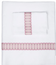
Flat Sheet Q $425 K $450

AVAILABLE IN WHITE | ITALIAN WOVEN EGYPTIAN COTTON SATEEN