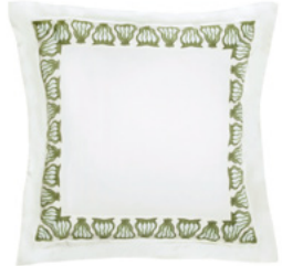
Bordered Euro $250