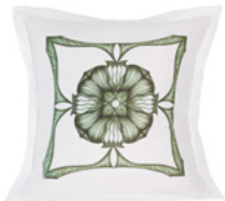
Accent Pillow $125