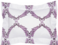
All-Over Boudoir $175