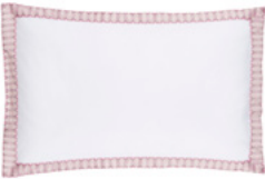
Bordered Sham S $225 K $250