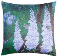
Accent Pillow $295