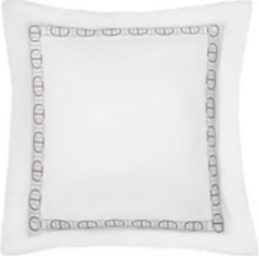
Bordered Euro $250