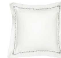
Bordered Euro $250