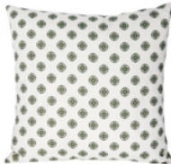
Linen Accent Pillow $215