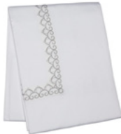
Small Bordered Duvet Q $625 K $750