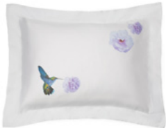
Sham Left S $195 K $225