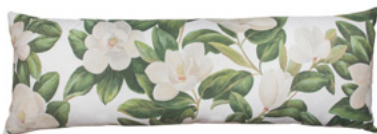
Linen XL Lumbar