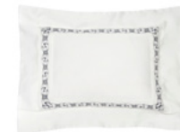
Bordered Boudoir $200