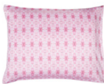
All-Over Sham S $195 K $225