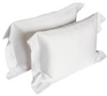
Sham S $195 K $235 E $235 B $170 *Sold Individually