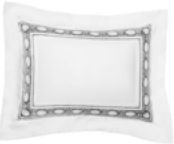
Bordered Boudoir $200