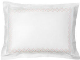
Bordered Sham S $225 K $250