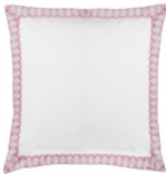
Bordered Euro $250