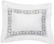
Bordered Boudoir $200