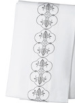
Bordered Duvet Q $625 K $750