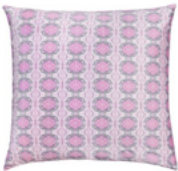
Accent Pillow $250