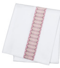
Bordered Duvet Q $625 K $750