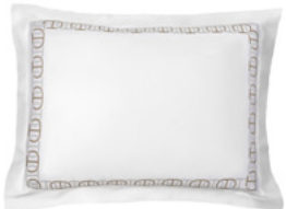
Bordered Sham S $225 K $250