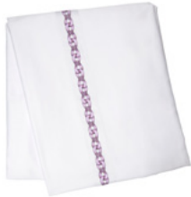
Bordered Duvet Q $625 K $750