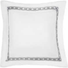
Bordered Euro $250