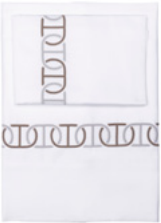
Pillowcases S $250 K $275 *Sold by the Pair