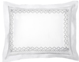
Bordered Sham S $225 K $250