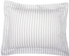
Sham S $195 K $225