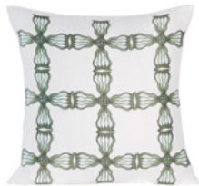
Engineered Euro $225