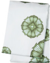
All-Over Duvet Q $595 K $695