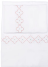
Pillowcases S $250 K $275 *Sold by the Pair