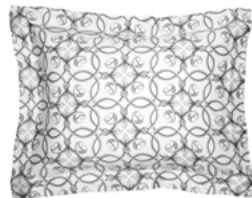
All-Over Sham S $195 K $225 E $225