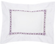
Bordered Boudoir $200