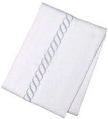
Bordered Duvet Q $625 K $750