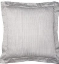
Narrow Stripe Euro $225