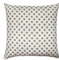
Linen Euro $250