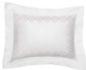
Bordered Boudoir $200