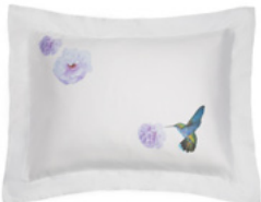
Sham Right S $195 K $225