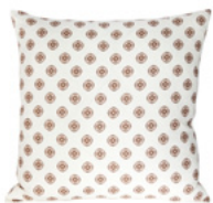
Linen Accent Pillow