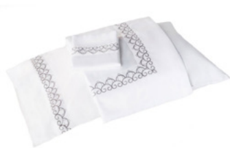
Pillowcases S $250 K $275 *Sold by the Pair