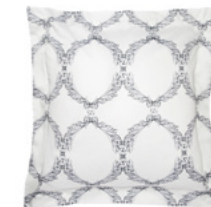
All-Over Euro $225