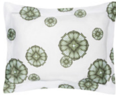
All-Over Sham S $195 K $225 E $225