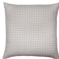
Linen Euro $250