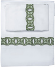
Flat Sheet Q $425 K $450

AVAILABLE IN WHITE | ITALIAN WOVEN EGYPTIAN COTTON SATEEN