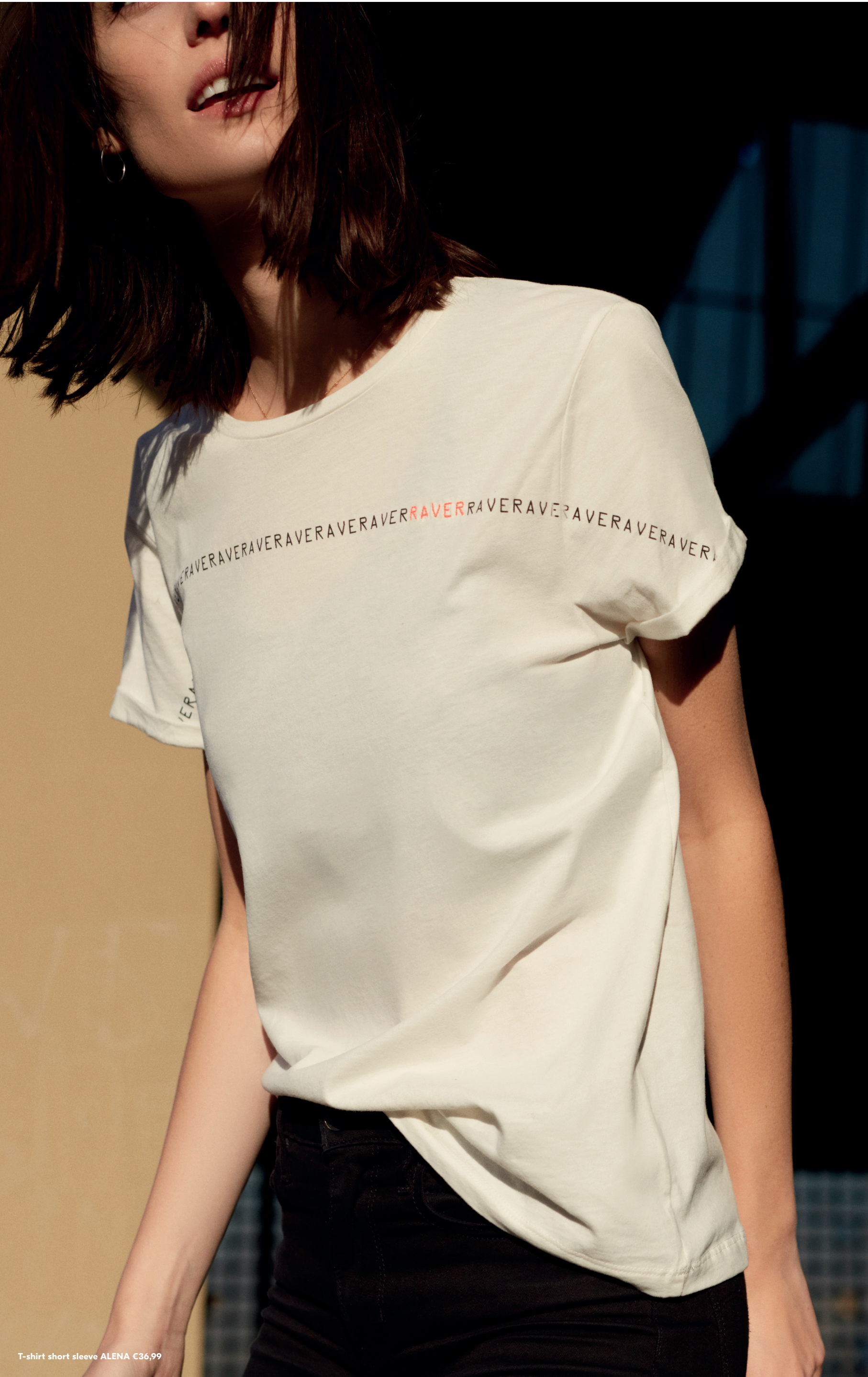
T-shirt short sleeve ALENA €36,99