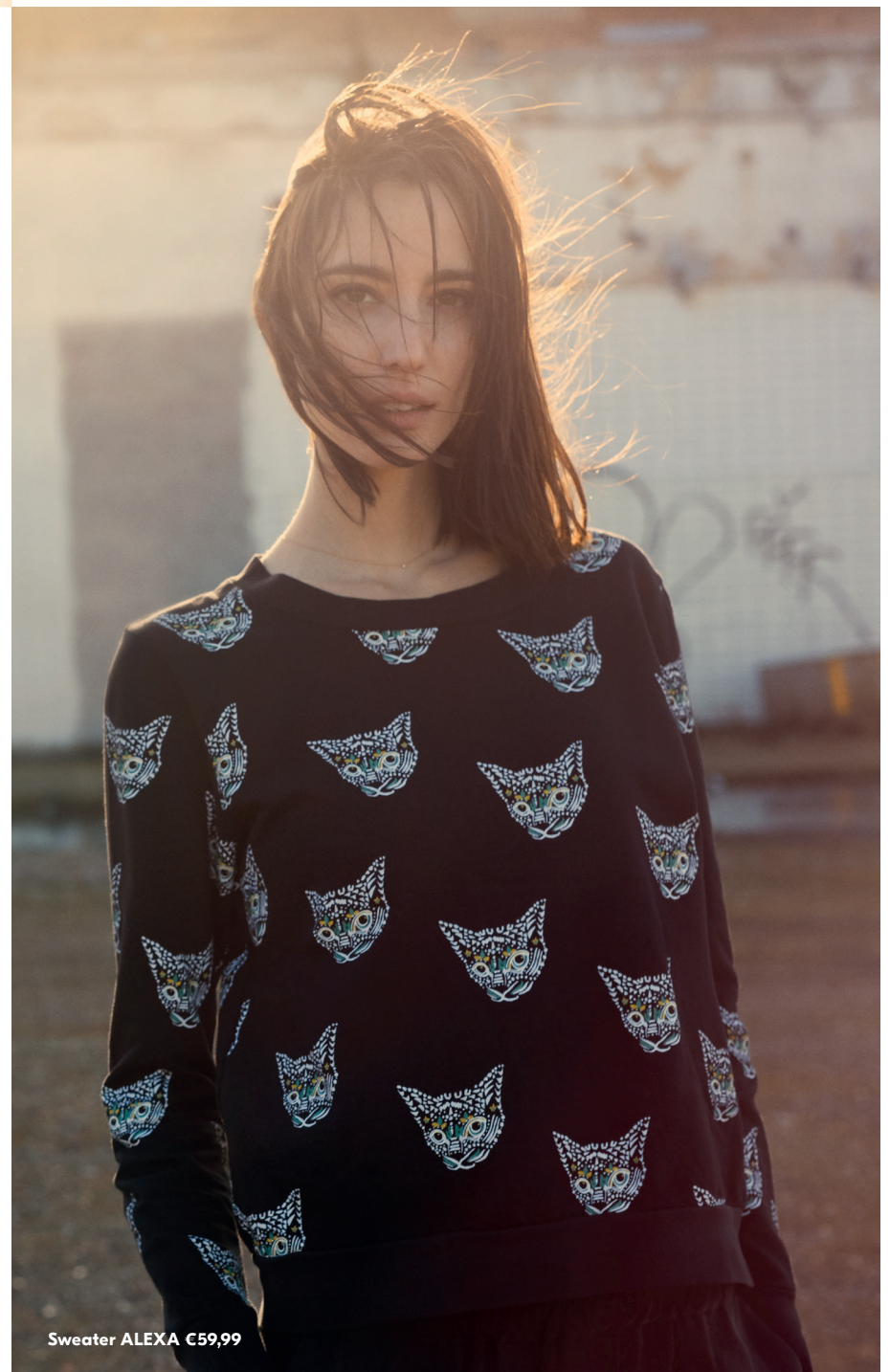
Sweater ALEXA €59,99

From an eye-catching bomber jacket, basic shorts and tops, T-shirt dresses to a full print jumpsuit: the entire clothing line is perfect to dance your feet off. According to Amélie the kimono is the perfect festival outfit. The Raver items from the past collection also got reinvented. Think unisex Raver T-shirts and new hoodies with Raver and cat embroideries.