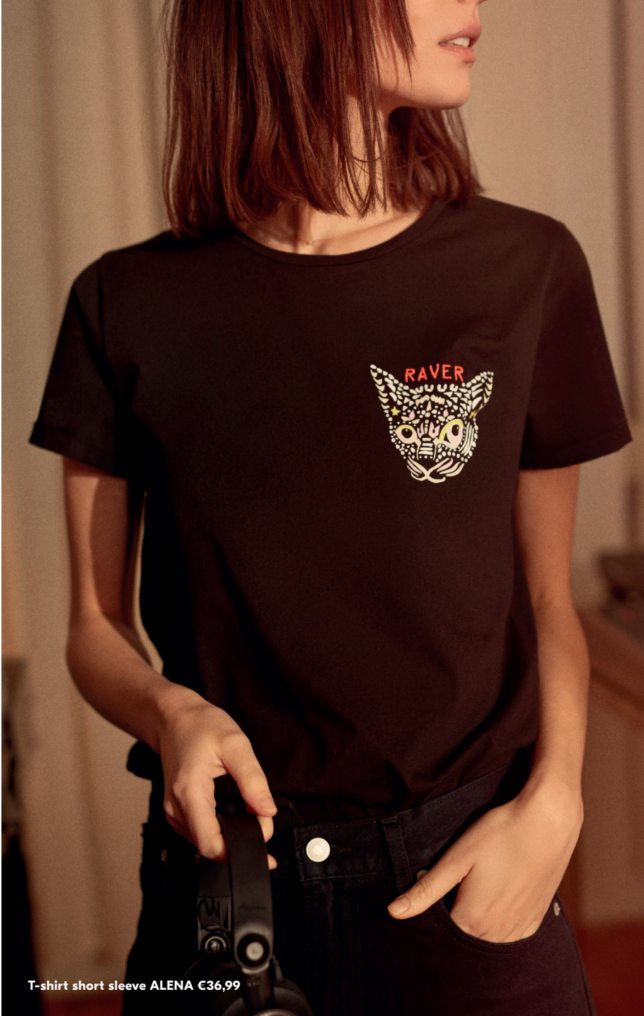
T-shirt short sleeve ALENA €36,99