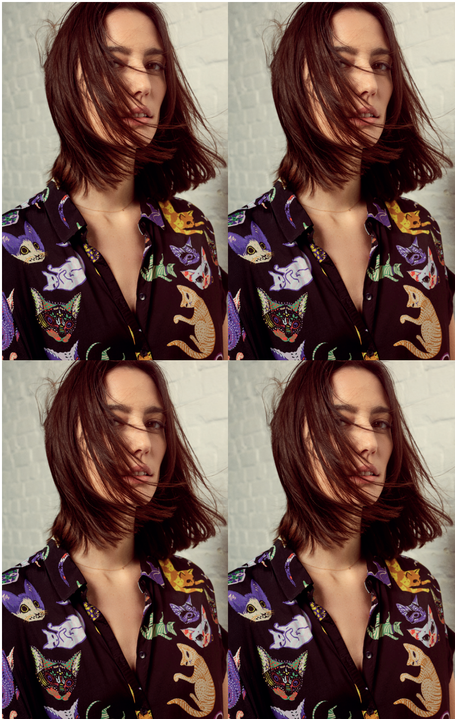
Blouse short sleeve ATHENA €69,99