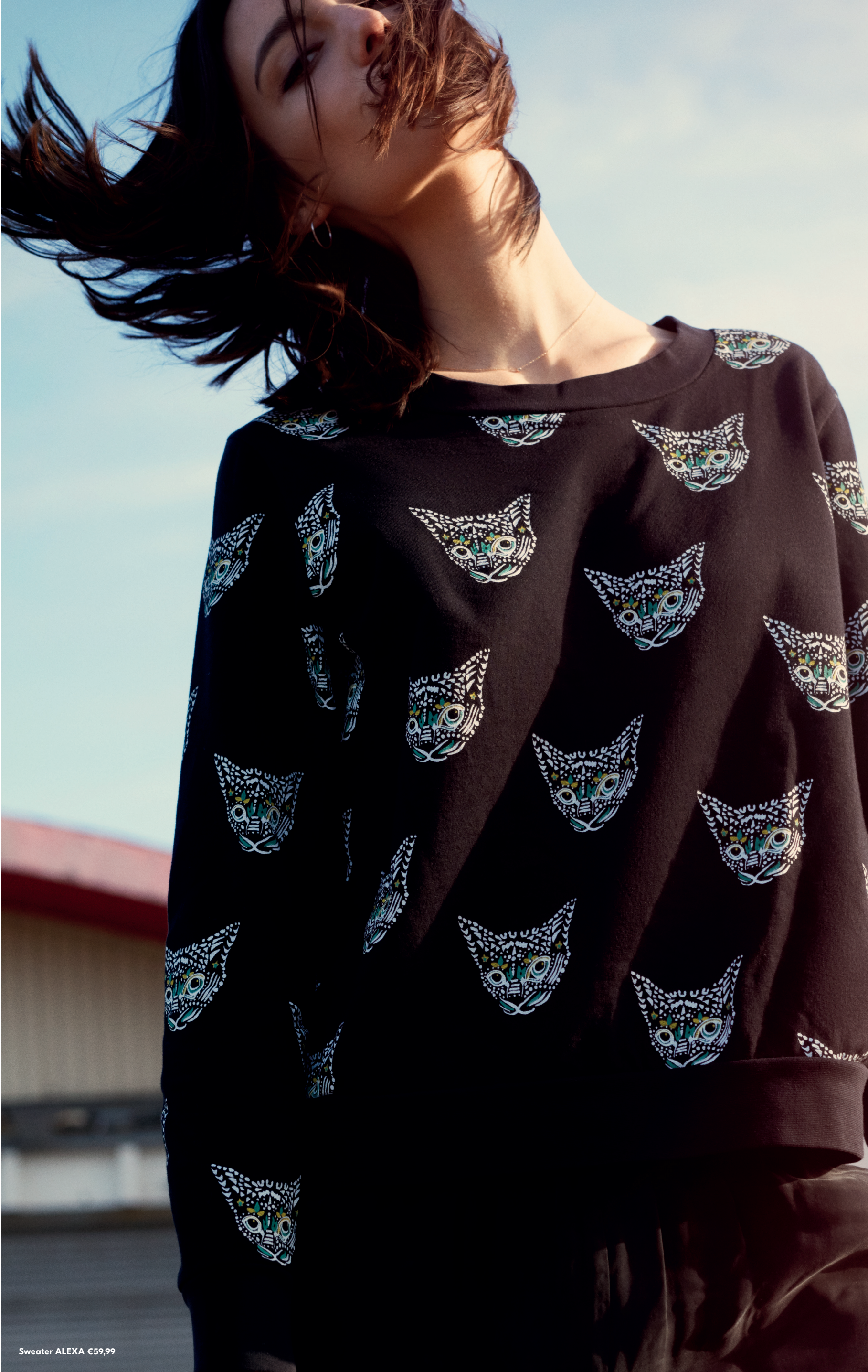
Sweater ALEXA €59,99