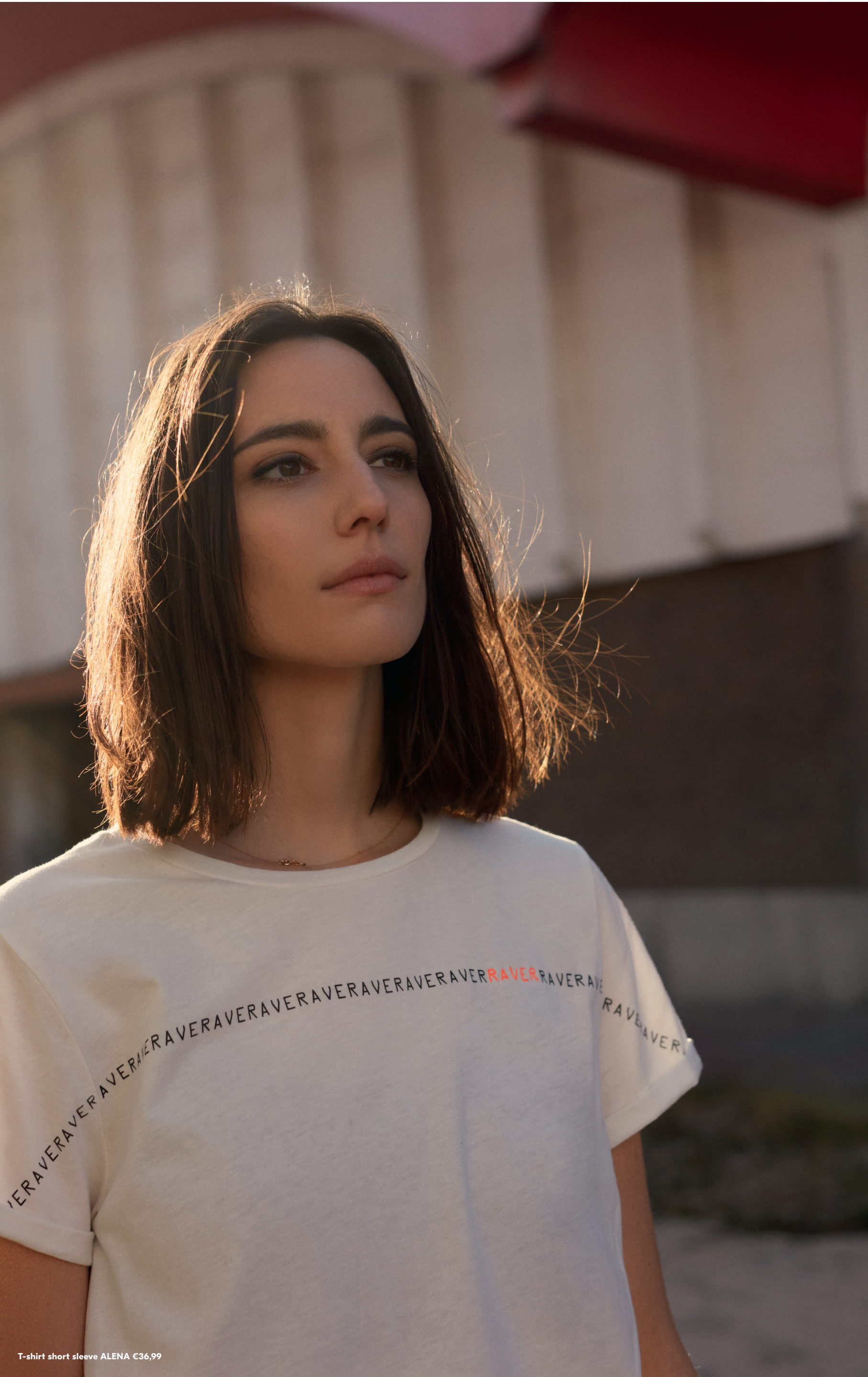
T-shirt short sleeve ALENA €36,99