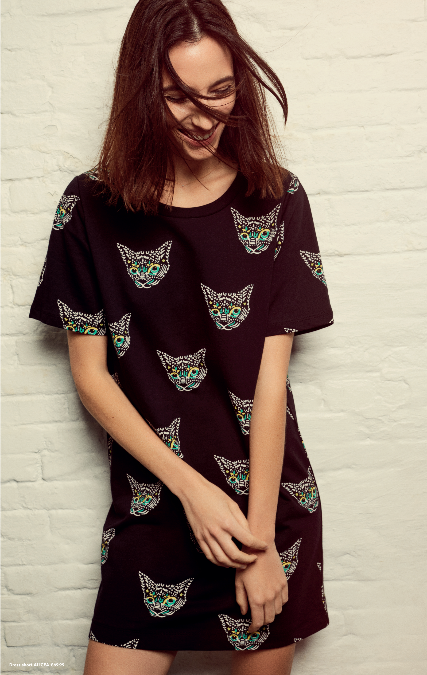
Dress short ALICEA €69,99