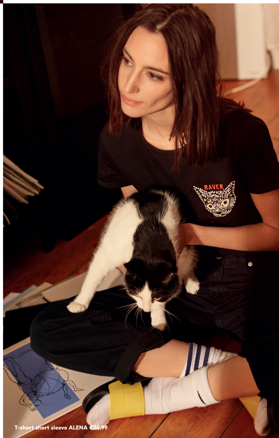
T-shirt short sleeve ALENA €36,99