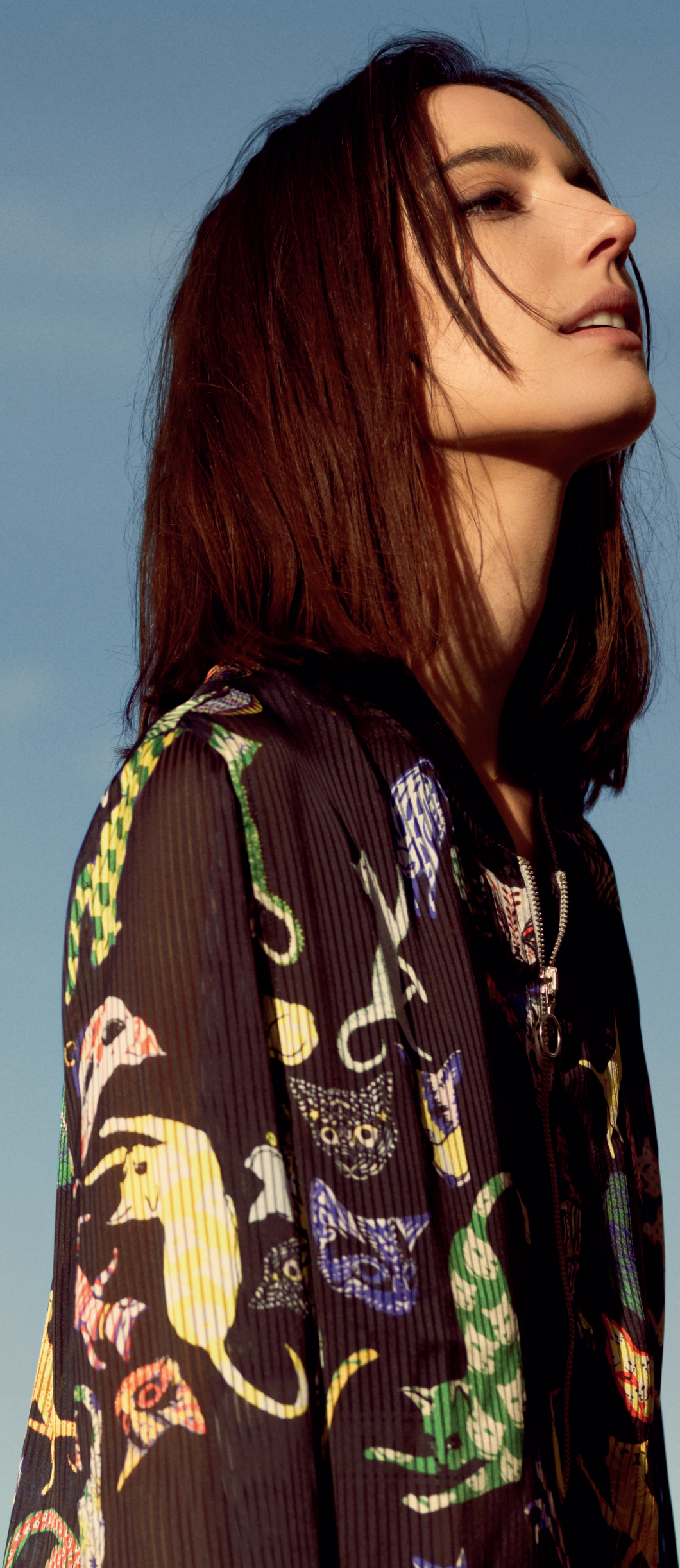
Jacketfantasy short ANISA €99,99