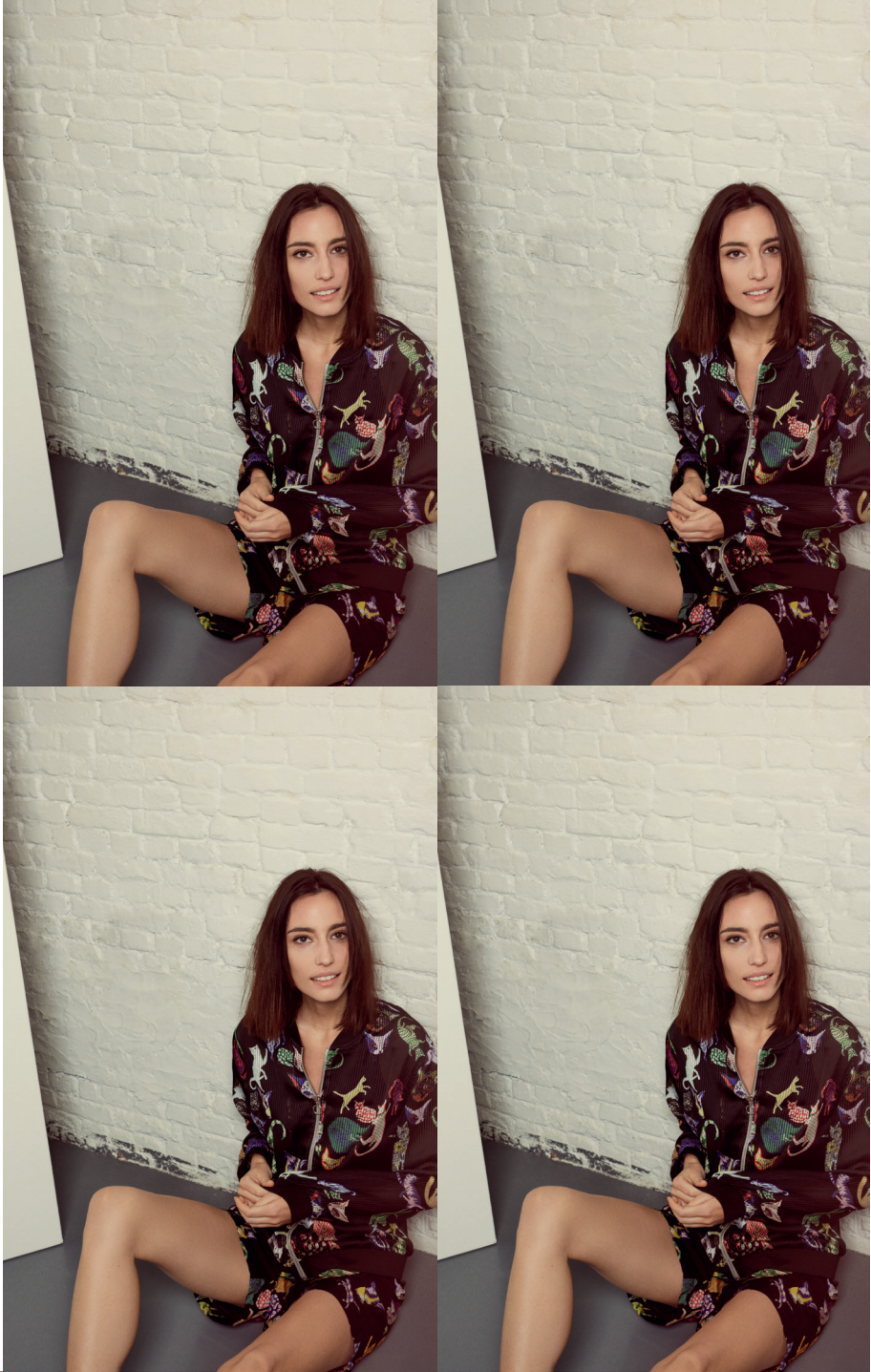
Jacketfantasy short ANISA €99,99, shorts NUUKCAT €44,99