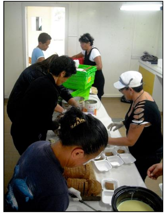
Puddings (for the Hangi) being assembled in the 'Dental Clinic' by our wonderful Wahine