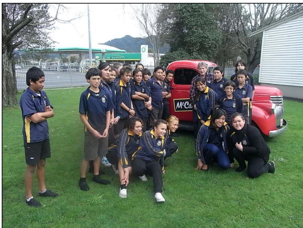
Room 09 senior Students posing with the 'Big Red 3.5 V8 Chevrolet McCains Veggie Truck'

Included in this talk by Tony was an explanation about what plants need to grow and the best conditions for growth. Tony eluded to the fact that the 'Waikato' is a very good growing environment.