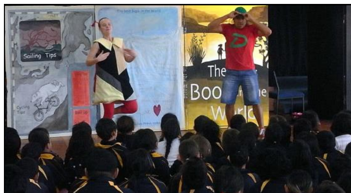
The Duffy Roadshow presenters ‘enthraling’ our tamariki with their ‘drama skills’

On Wednesday the ‘Duffy (Books in Homes) Roadshow’ performed to all students in our school hall. This was an hour long presentation of the highest quality given to us by three extremely enthusiastic, capable and motivated young adults. This dramatic presentation was intended to promote and highlight the importance of ‘reading in schools and at home’ and how books are a most valuable asset for all of us! This was more than successfully achieved!