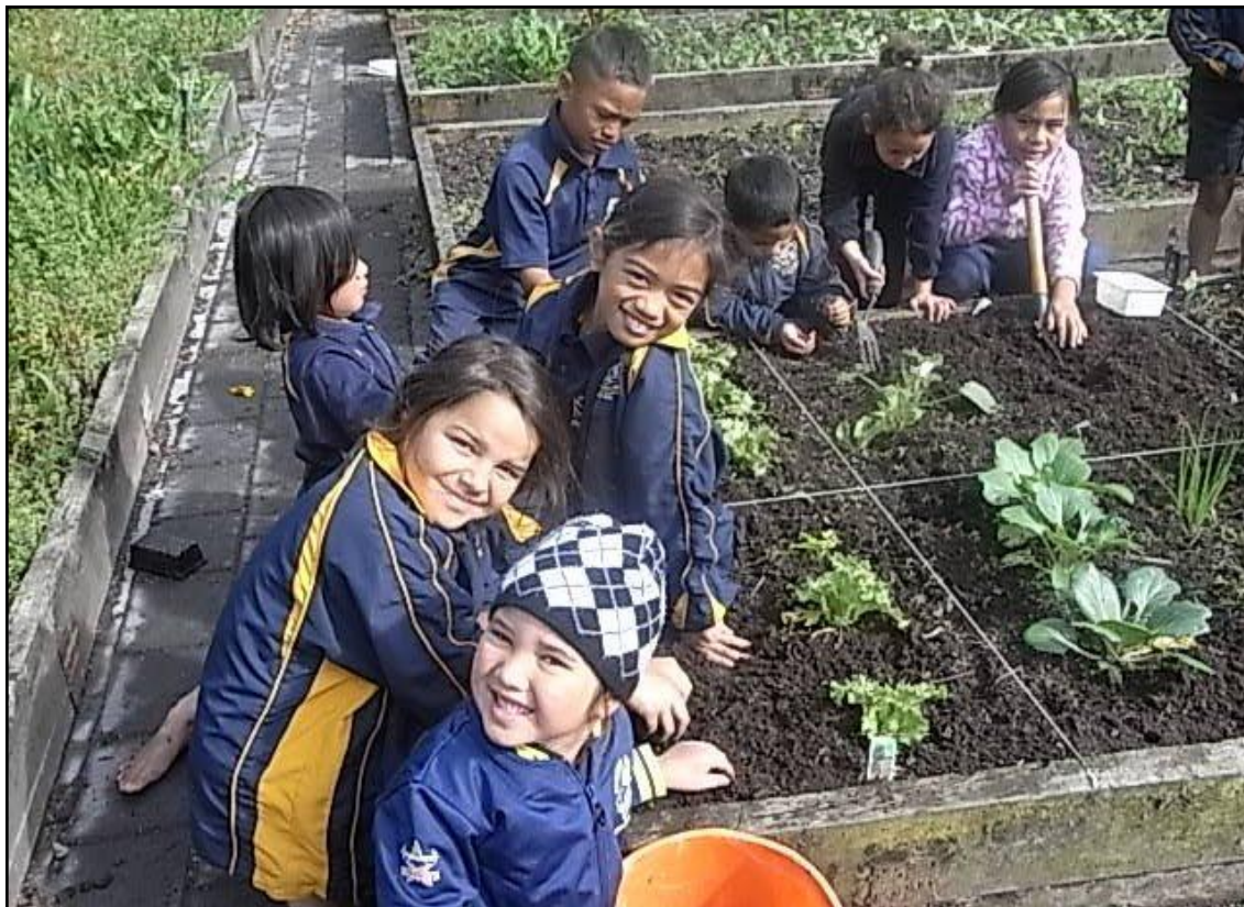
Our junior school tamariki enjoying their time 'at work in their garden!'