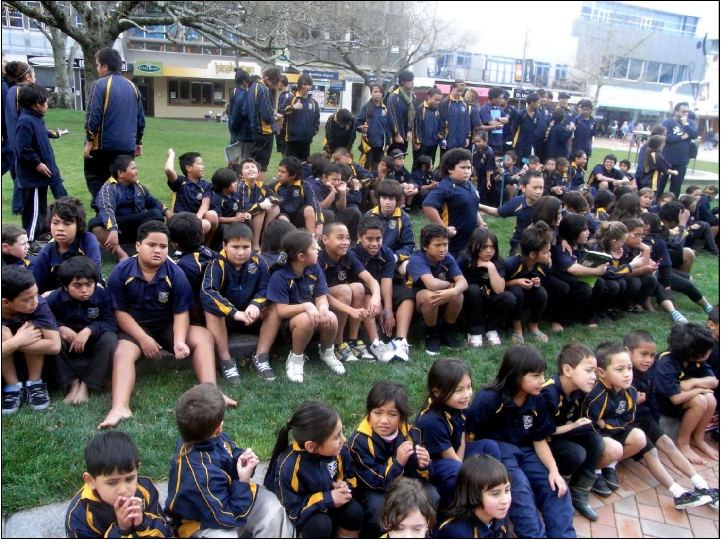
Ngaruawahia students waiting patiently for the 'Victory Parade' to get underway!!