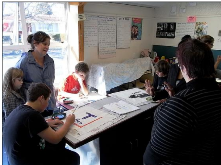
Horsham Down students hard at work in Soft Materials.

Over the past two weeks our Technology Team provided an opportunity for caregiver(s)/parent(s) to visit the Technology Centre here at Ngaruawahia Primary School and see programmes in action. There were many positive comments and the feedback from outside school communities was very complementary.