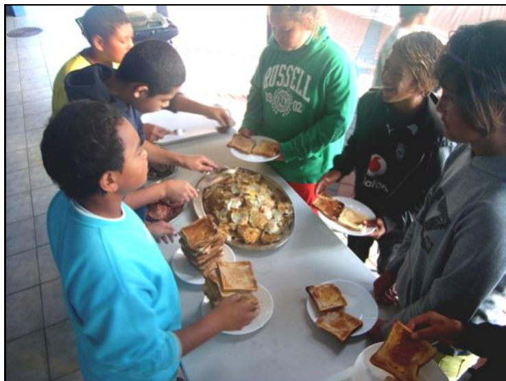
Krome, Weis & Jahnaea serving a cooked 'Breakfast' to 'The Team'