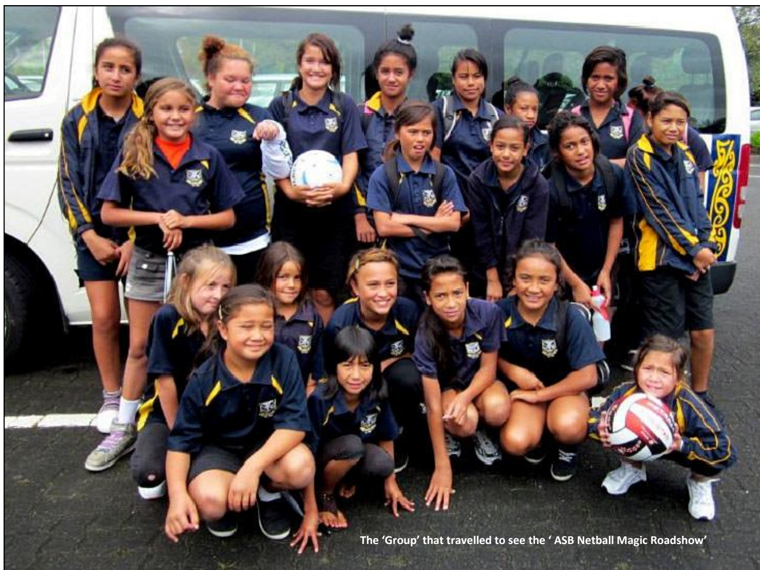
The 'Group' that travelled to see the 'ASB Netball Magic Roadshow'