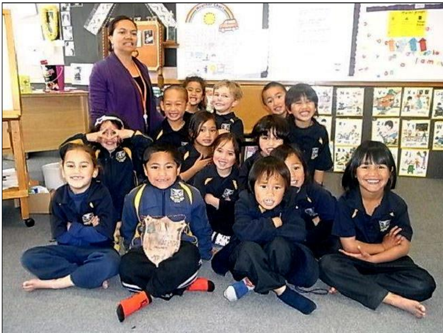
Room 04 & Whaea Kahu have won this weeks 'Environmental Shield' for having the neatest and most tidy classroom that includes outside and around room 04.