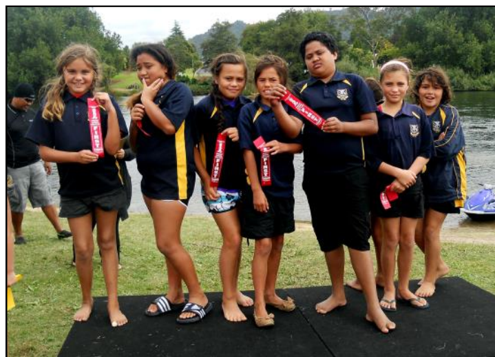
Our year 5 & 6 Girls Team proudly displaying their 'first place' ribbons after winning their final.

On Monday our senior students (Rm's 8/9) were involved in a Civil Defence Emergency Practice that took place in our school. This was a 'mock' exercise (a devastating tornado had struck our area.); that involved trained staff and volunteers from our Hamilton City Council Civil Defence Emergency Team.