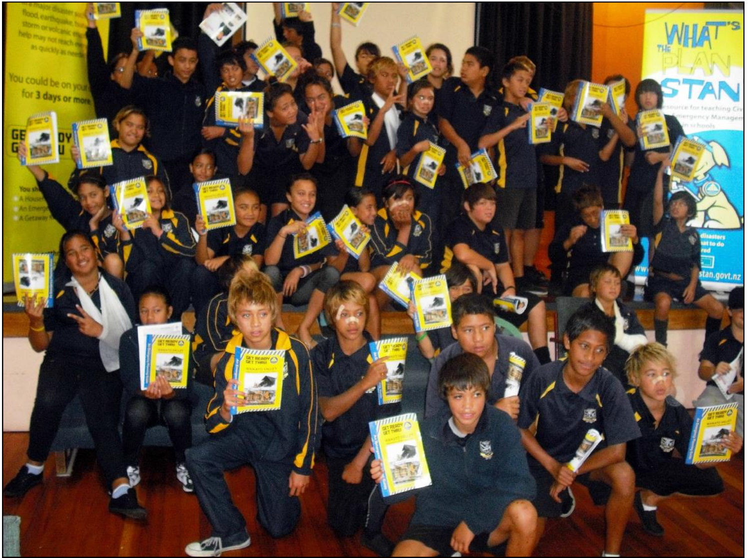
Room's 8 & 9 students 'proudly posing' at the end of the Tornado Alley exercise.