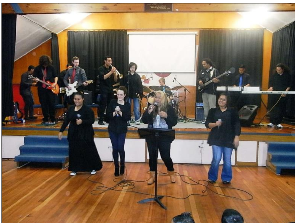
The 'Avondale College Band' demonstrating their talents and skills!

There was even a time where most of our tamariki were up and dancing while the band did their thing. It was truly a worthwhile experience for all. In appreciation our staff provided a morning tea and as a school & community, a koha was given. We look forward to their return in 2013!