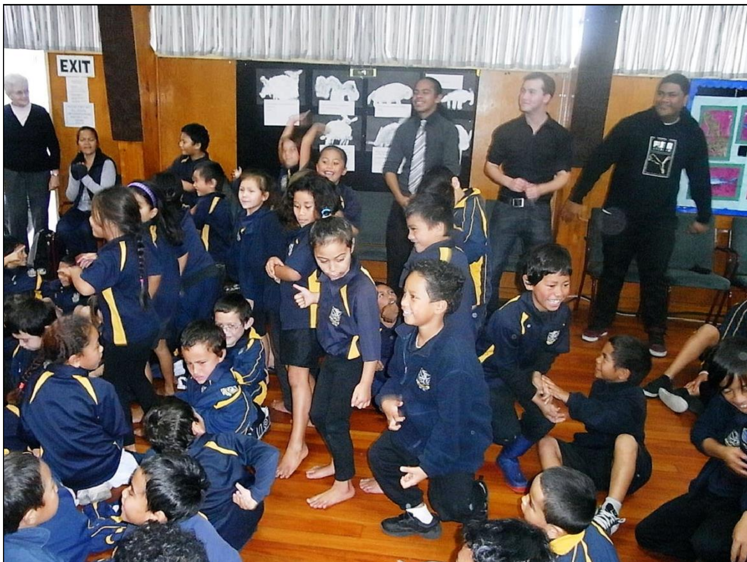
N.P.S. tamariki 'strutting' their stuff to the 'beat'.

On Wednesday 6 th June as a school we were treated to an hour long 'Musical Extravaganza' by an extremely talented group of year 13 students visiting from Avondale College in Auckland. They played a variety of musical instruments and musical genre (Reggae to Rock), and had moments of both 'fun and humorous interaction' with our tamariki which was much appreciated by all.