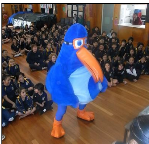
Koru in full throttle, doing his ‘thing’ to Brooke Fraser’s song, ‘ Something in the Water ’