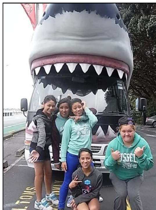
(Right) Room 09 Seniors outside 'Kelly Talton's' posing with a 'Great White Shark' out of water and NOT real! (Thank goodness)