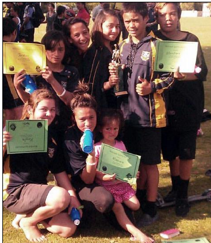
Our 'fantastic' Senior N.P.S. 2- Mini-Ball Team that finished runner-up in the 'Inter-School Competition' held on Wednesdays after school.