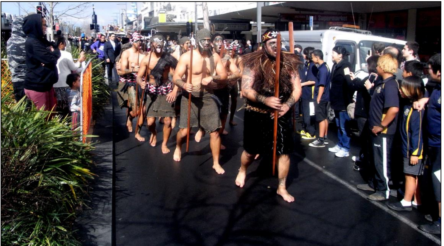
The 'Chiefs' Kapa Haka , supporters group, with our tamariki looking on, leading the 'Victory Parade'