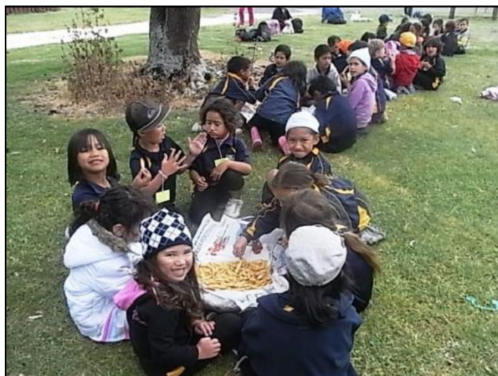
Our Junior School 'Chipping' in for a lunch treat!