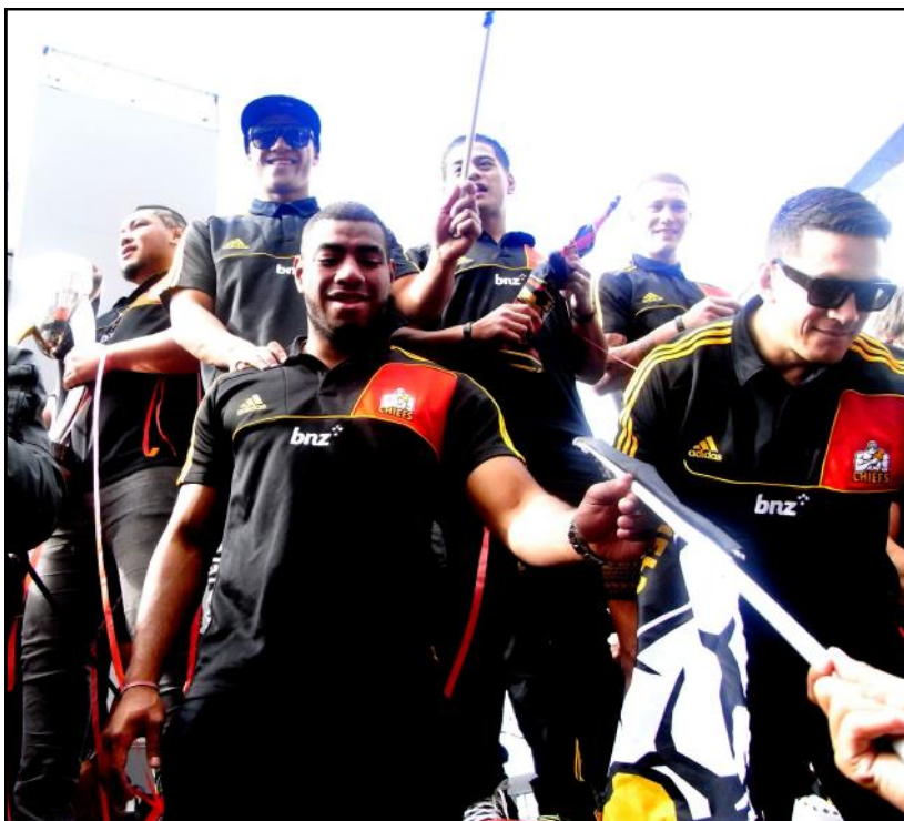
Sonny Bill .....‘a student favourite’ with other members of the chiefs”

Because over this entire season, Ngaruawahia Primary School has been a strong supporter of ‘The Waikato Chiefs Rugby Team’ it was decided ‘spontaneously’ by all staff at our Monday staff meeting, that we should give ALL students (Junior to Senior) an experience first-hand of the ‘Celebratory Victory Parade in Hamilton’s Victoria Street’ with our all-conquering Waikato Chief’s Rugby Team. Buses were somewhat hard to come at such short notice BUT after a bit of juggling, jingling and phone call reconnaissance, we were able to secure 4 large buses for our 180 tamariki and 15 adult staff. The experience saw us all screaming and cheering our support for our local heroes. Some staff (and students) got to touch Sonny Bills’ hand and won’t be washing for a week. This occasion will be long remembered by all and there is a very strong chance that some of our local heroes will be visiting our own Ngaruawahia Primary School next week.