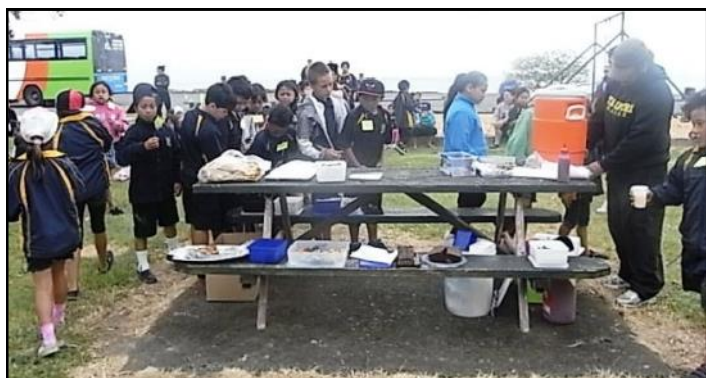
Junior School at Kaiaua Beach enjoying their 'Kai'