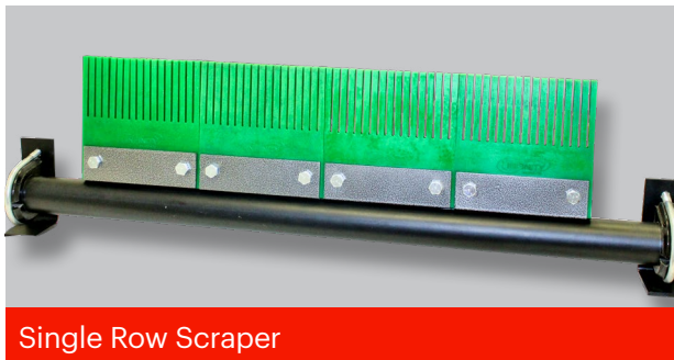
Single Row Scraper