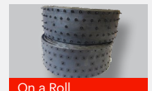
On a Roll