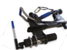
Wind Tower Alignment Tool