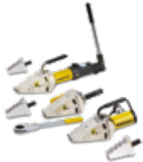
Flange Spreading Tools

When joints need to be assembled, separated or correctly aligned, nut cutters and flange spreaders offer controlled separation while alignment tools rectify twist and rotational misalignment without additional stress in pipelines.