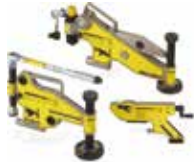
Flange Alignment Tools