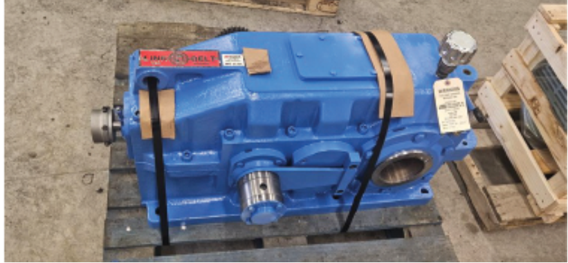
Gearbox post repair and assembly, ready to be rushed back to site