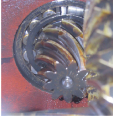
Damaged input shaft bearing (note the displaced rolling element center top)